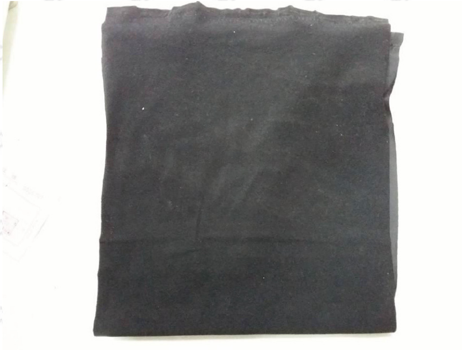
Overall View of Sample