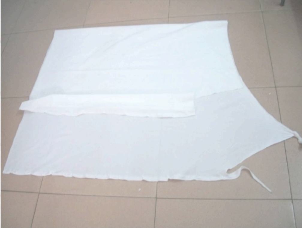
Overall View of Sample