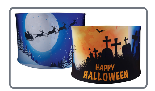
Optional Lycra Design A (Halloween/Christmas) Order code: EQLED155A