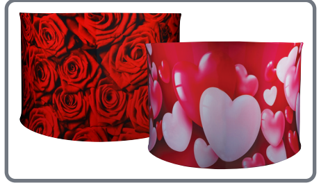
Optional Lycra Design B (Hearts/Roses) Order code: EQLED155B